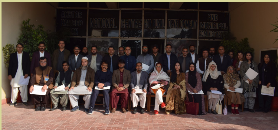
Group photo of Participants with Director (Training)

The contents included in the training course covered a broad range of topics essential to understanding ethical leadership and effective management in the workplace. The course comprised intellectually stimulating and participatory ses-