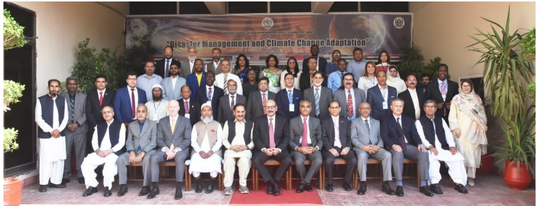
Group photo of Participants, Members of Diplomatic Corps, NCRD Officers and Distinguished Guests with the worthy Chief Guest of the ceremony

Akhtar Hameed Khan National Centre for Rural Development (AHKNCRD) conducted an International Training Workshop on "Disaster Management and Climate Change Adaptation" in collaboration with African Asian Rural Development Organization (AARDO) at NCRD during October 15-23, 2025. Twenty-one (21) delegates from 12 AARDO member countries, including Pakistan, Bangladesh, Egypt, Eswatini (Kingdom of Swaziland), Ghana, Jordan, Kenya, Lebanon, Mauritius, Sri Lanka, Tunisia and Zambia, attended this training programme.