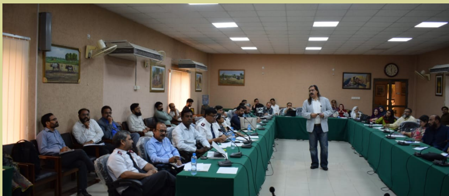
A glimpse of one of the training sessions