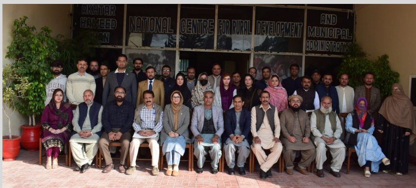
Group photo of participants with Director General, NCRD

Overall, the course was regarded as a valuable learning experience that contributed meaningfully to professional development and improved project management practices. The programme was concluded with a hope that the training course would have added much to the knowledge and thought paradigm of the participants regarding the subject topic.