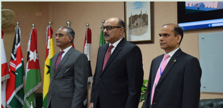
Secretary, Establishment Division (Centre), Director General, NCRD (to his right) and Head of Finance Division and Coordinator for Regional Offices (South and Central Asia), AARDO (to his left)

As part of the training workshop, participants were taken on field visits to key institutions engaged in disaster management, climate resilience, and sustainable agriculture. The visits included: National Emergency Operation Centre (NEOC) of NDMA; Islamabad; Punjab Rescue Headquarter (Rescue 1122), Lahore; Barani Agriculture Research Institute (BARI), Chakwal; Soil Water Conservation Research Institute (SAWCRI), Chakwal; Centre of Excellence for Olive Research & Training (CEFORT), Chakwal; Dhara-bi Dam, Chakwal; Forest Department of Punjab, Murree; and Pakistan Meteorological Department, Islamabad.