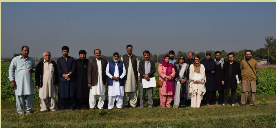
Group photo of participants with the Course Coordinator during the field visit

how building knowledge and technical capacity in renewable energy technologies, such as solar, wind, and waste-to-energy solutions, can empower professionals to implement innovative and practical solutions in their respective sectors.