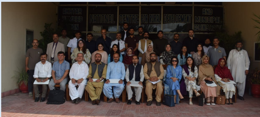
Group photo of Participants with Director (Training)

explored the importance of accountability, transparency, and citizen engagement in fostering trust and ensuring that local development initiatives address the real needs of communities. The training further examined practical approaches to enhancing the efficiency and effectiveness of local governance,