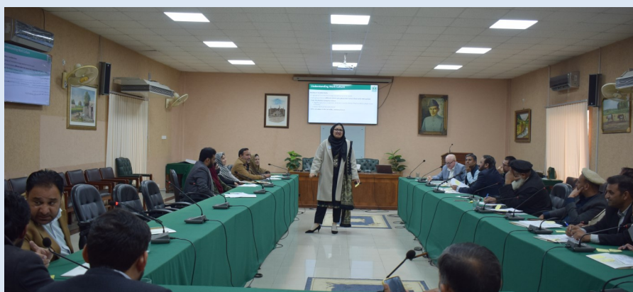
Glimpse from one of the training sessions