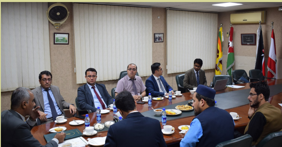
Glimpse from the meeting. Director General, NCRD, briefing the Dignitaries

pressed their sincere gratitude to the Director General, NCRD, for hosting the meeting and facilitating a productive discussion.