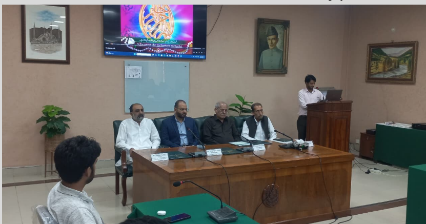
Glimpse from the seminar proceedings