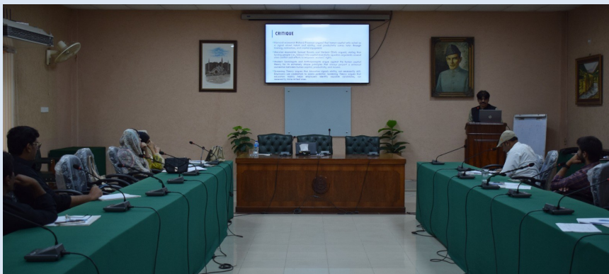
A glimpse from one of the training sessions in progress