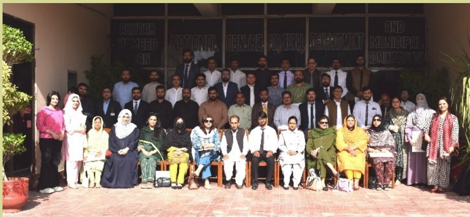
Group photo of Participants with Director (Training)