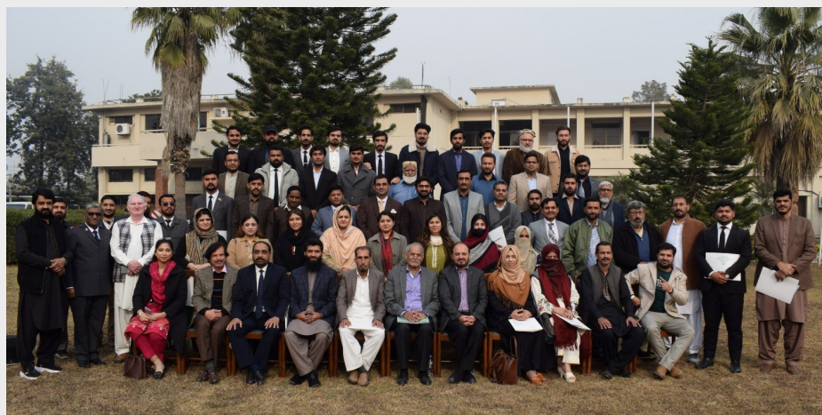
Group photo of participants with Panelists and NCRD Officers after the seminar

perspectives with one another, as well as with the resource persons.