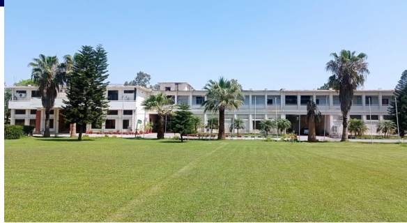
View of the Main Building of NCRD