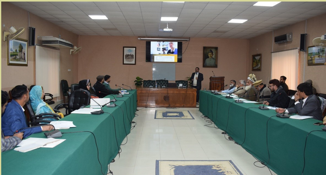
Glimpse from one of the classroom sessions of the training course